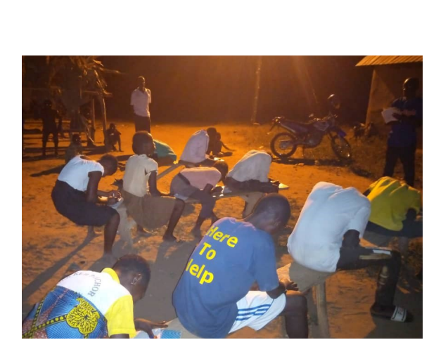
Some classes meet at night using one solar powered lantern for light.

Blessings, Cam and Anne Gongwer Soli Deo Gloria