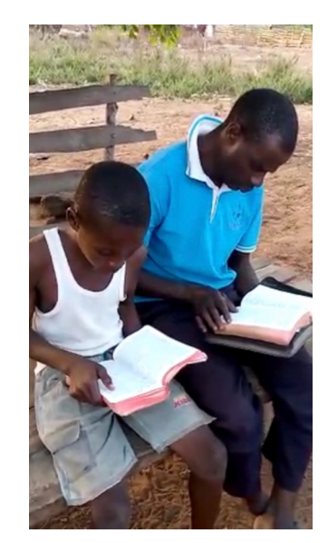
Reading their primer or the Bible.