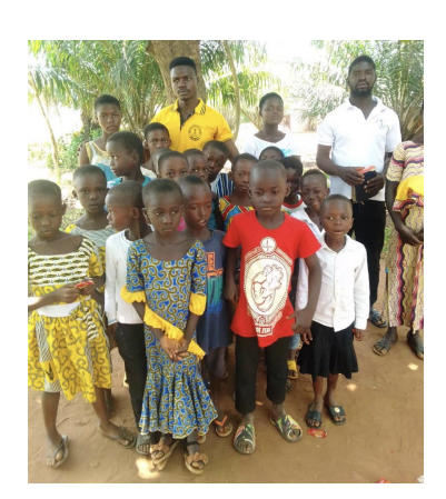
Most classes meet after church, kids all dressed up.